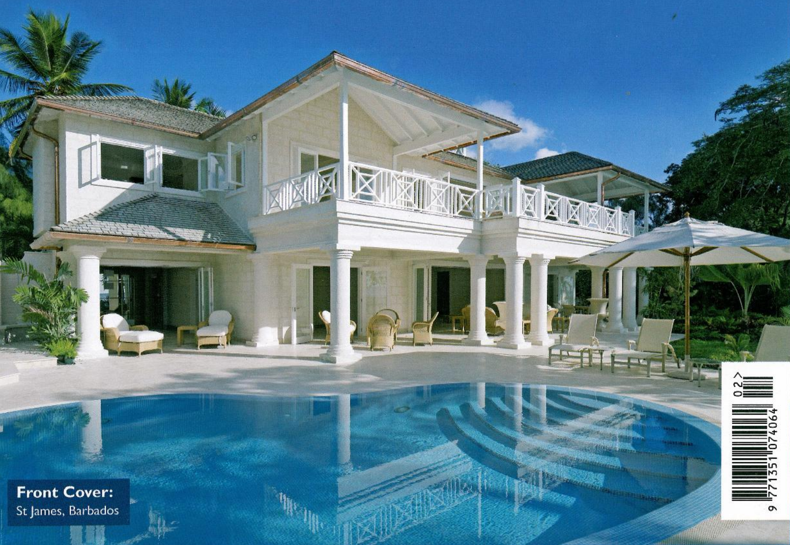
Front Cover: St James, Barbados

FREE INSIDE: World's Best Awards Supplement